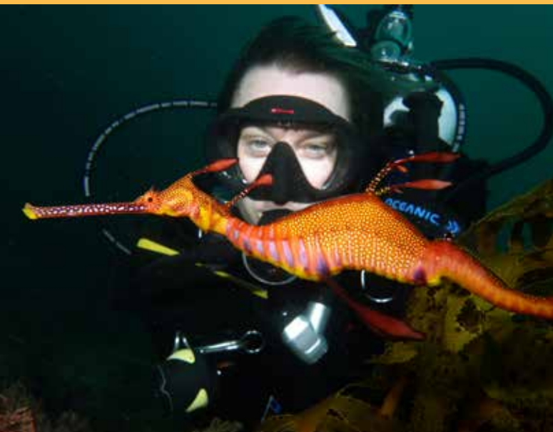
Weedy seadragons lend themselves to citizen science, for they are highly photogenic and each has a unique spot pattern on its flanks, which allows for photo-identification and long-term monitoring of individuals.