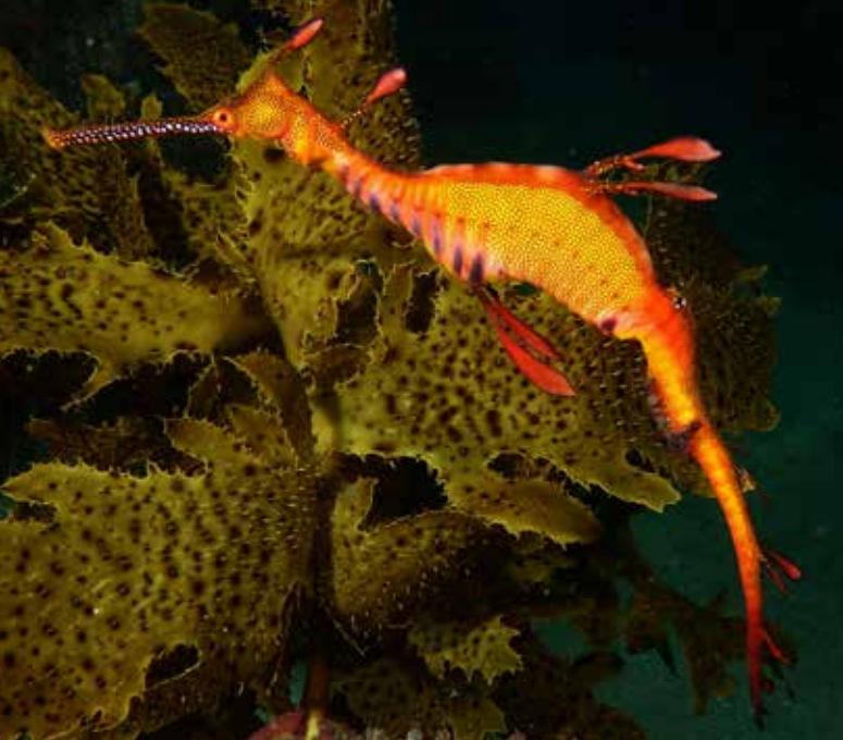
The name 'syngnathid' refers to their jaws, which are united into a tube-shaped snout with a tiny mouth at the end. Syngnathids range across temperate and tropical oceans, with southern Australia having particularly high diversity. The weedy seadragon is one of the largest, ranging up to about 45 centimetres. It is found along much of the southern Australian coastline, from Port Stephens (NSW) to Actaeon Island (Tasmania) to Geraldton (WA).