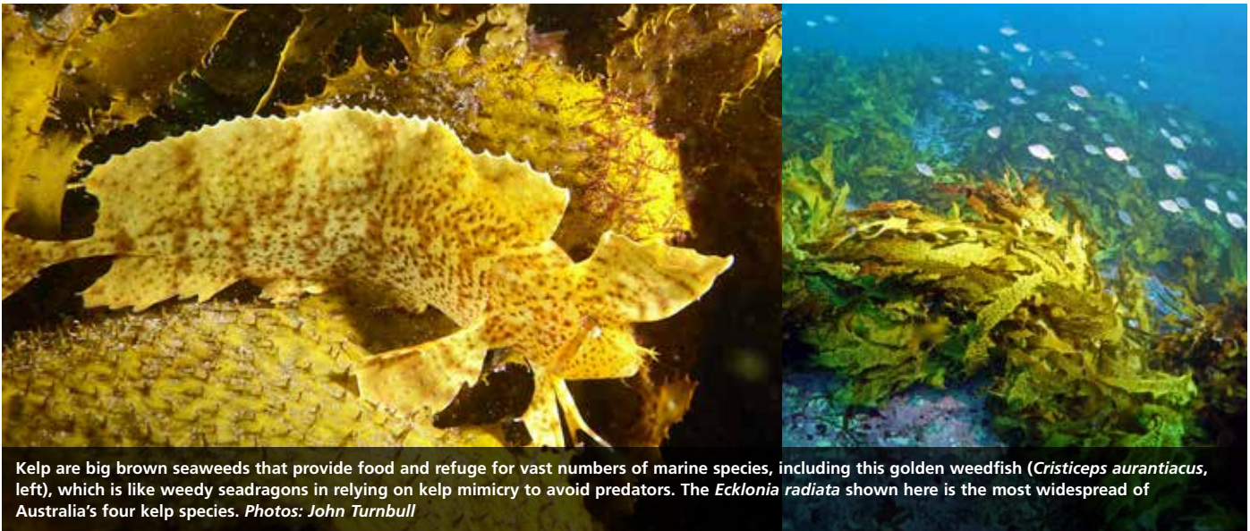
Kelp are big brown seaweeds that provide food and refuge for vast numbers of marine species, including this golden weedfish ( Cristiceps aurantiacus , left), which is like weedy seadragons in relying on kelp mimicry to avoid predators. The Ecklonia radiata shown here is the most widespread of Australia's four kelp species.